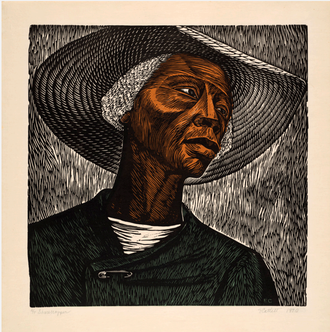
© Collect Moya Family Trust / VMCA at Artists Rights Society (ARS), NY / The Art Institute of Chicago / Art Resource, NY